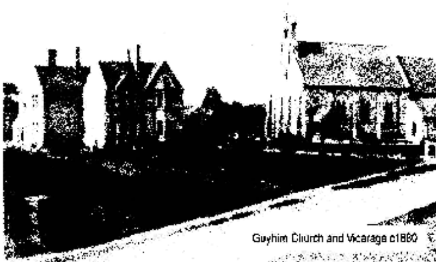
Guyhirn Church and Vicarage c1880